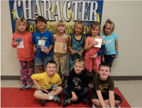
August Kindergarten Birthdays